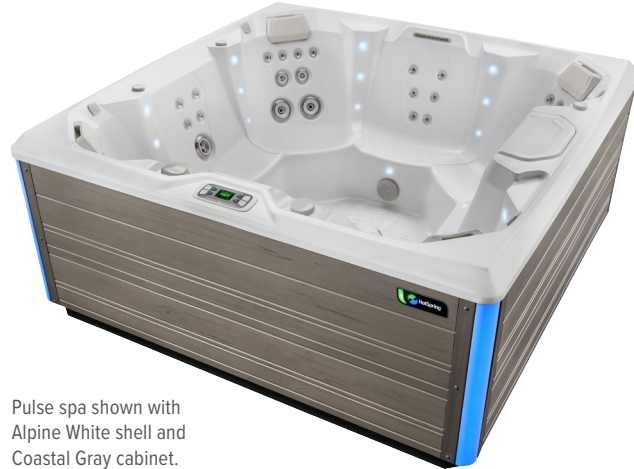
Pulse spa shown with Alpine White shell and Coastal Gray cabinet.